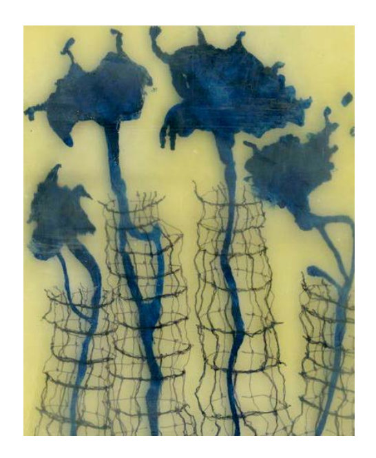
AUGUSTA TALBOT Nightshade (detail) Encaustic on panel

Learn more about Augusta's work at <u>augustatalbot.com</u>.